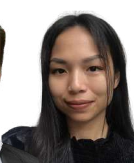
Onnicha Rattanopas Interface Polymers