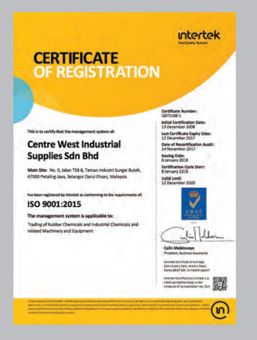
• IS09001: 2015 (CWI)