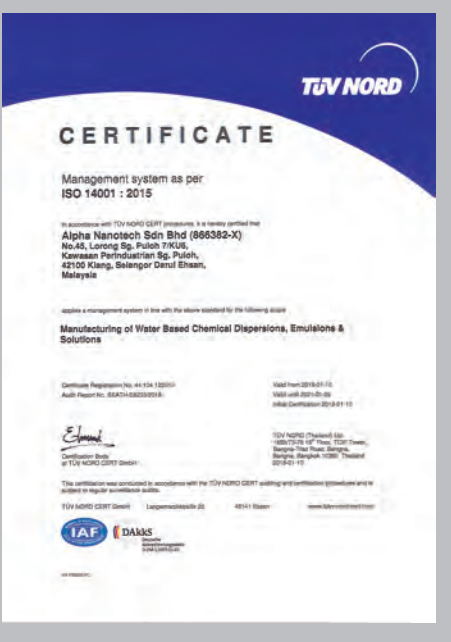
• IS014001: 2015 (Alpha Nanotech)